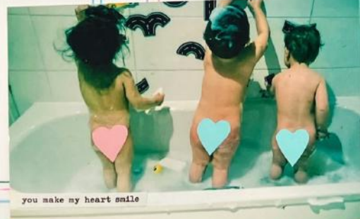
you make my heart smile

My 3 oldest grandchildren were born within 6 months of each other. It was really important to me that they shared quality time with me. They spend many weekends at my home.