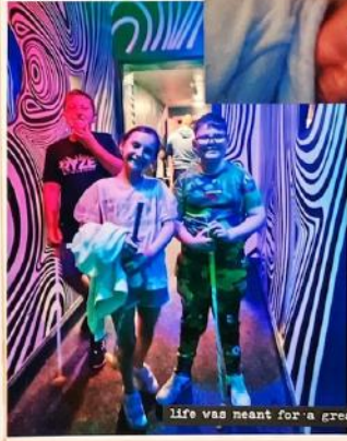
life was meant for a great adventure