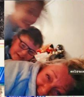
embrace beautiful chaos