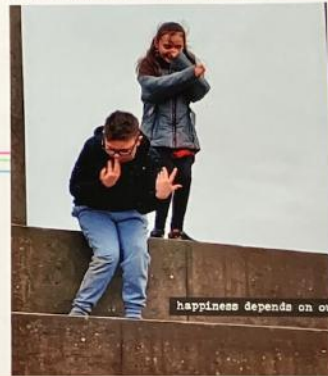
happiness depends on ourselves