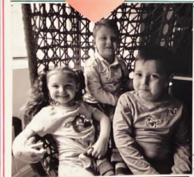
together is the best place to be hello my darling