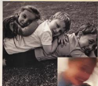
everything has beauty