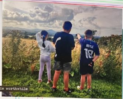
adventure is worthwhile