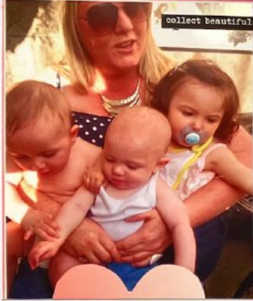
collect beautiful moments