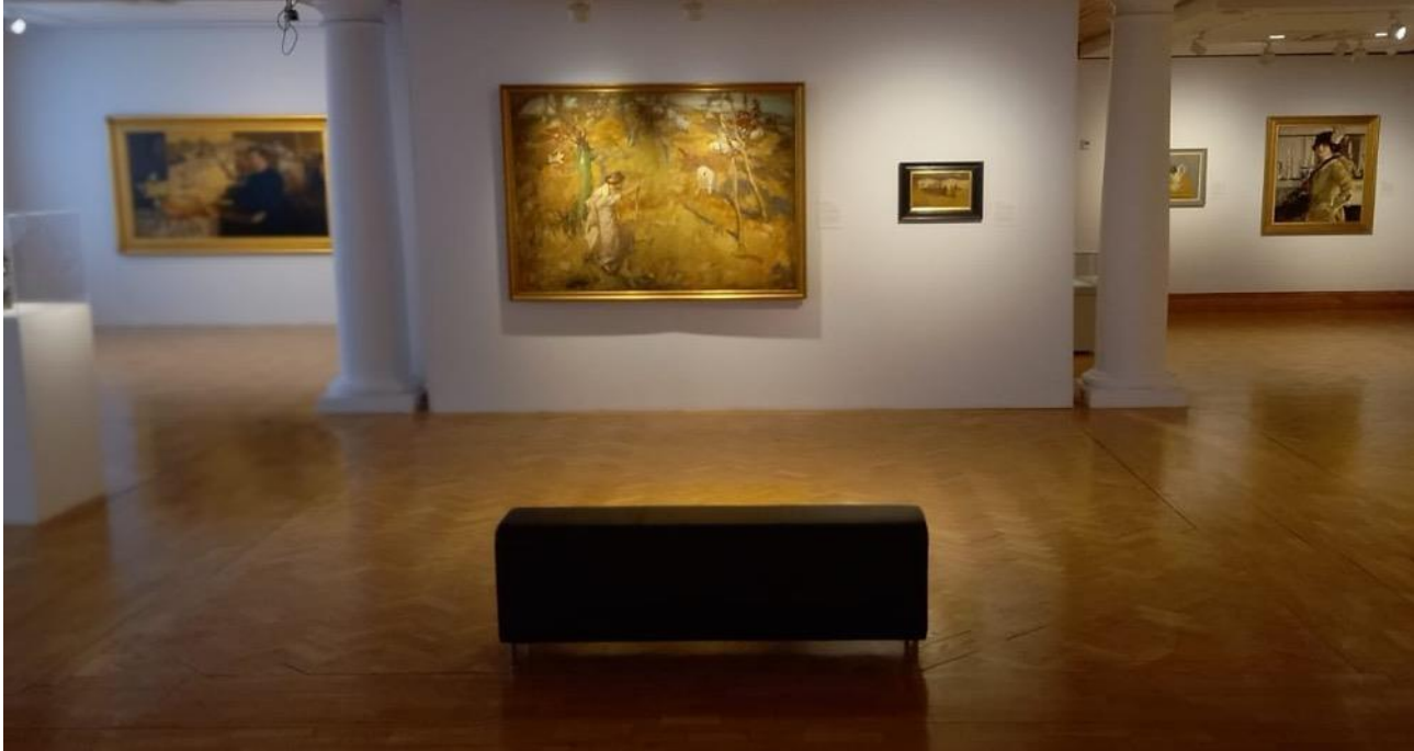
National Treasure exhibition, City Art Centre