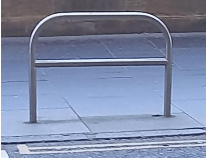
Bike rails opposite the City Art Centre