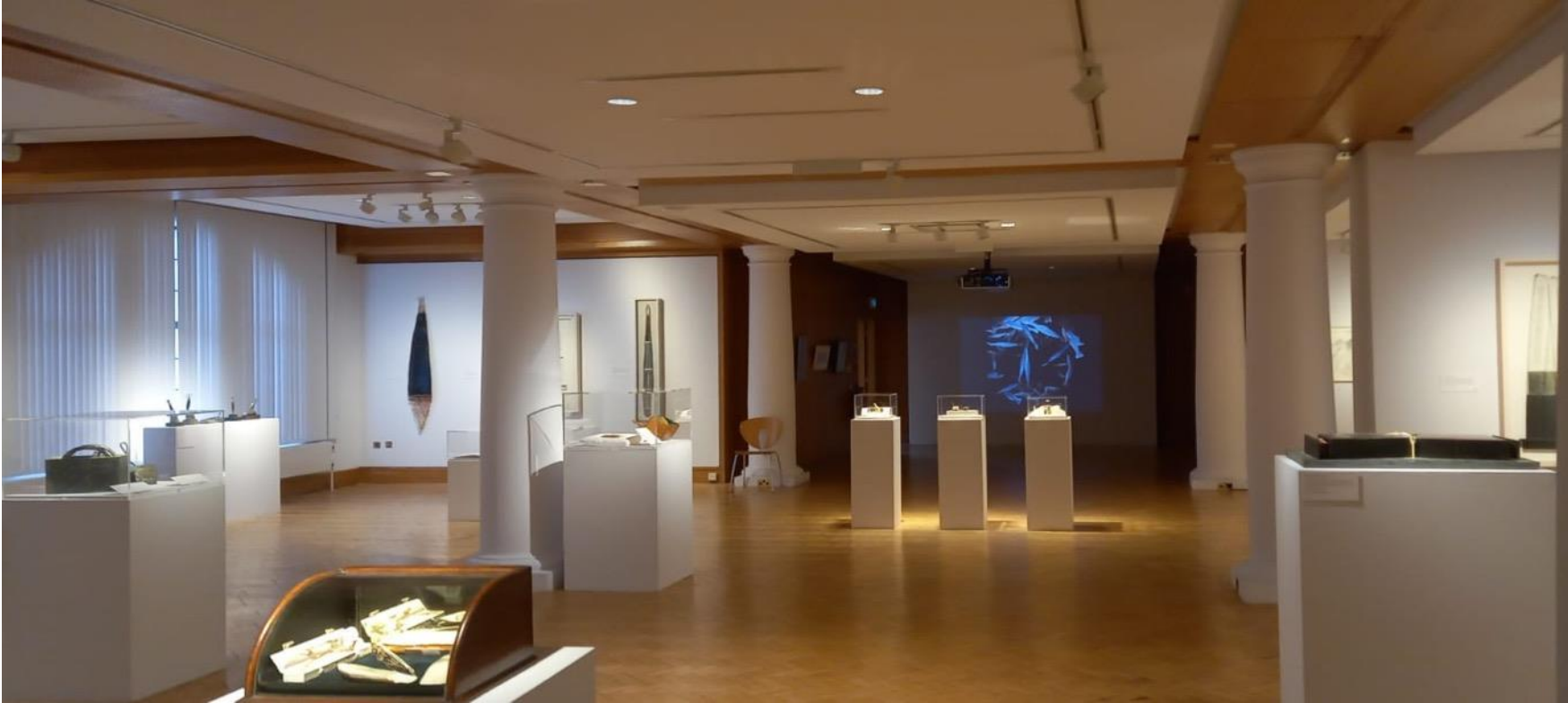
Will Maclean: Points of Departure exhibition, City Art Centre