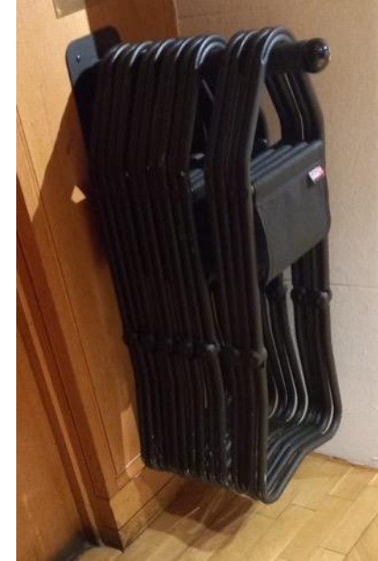
We have foldable stools for those that require a seat