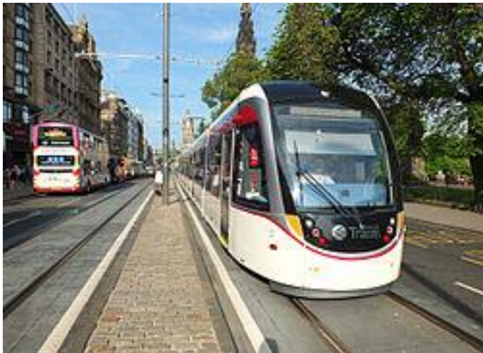
Trams on Princes Street