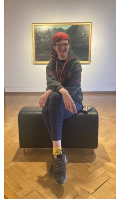
National Treasure exhibition, City Art Centre