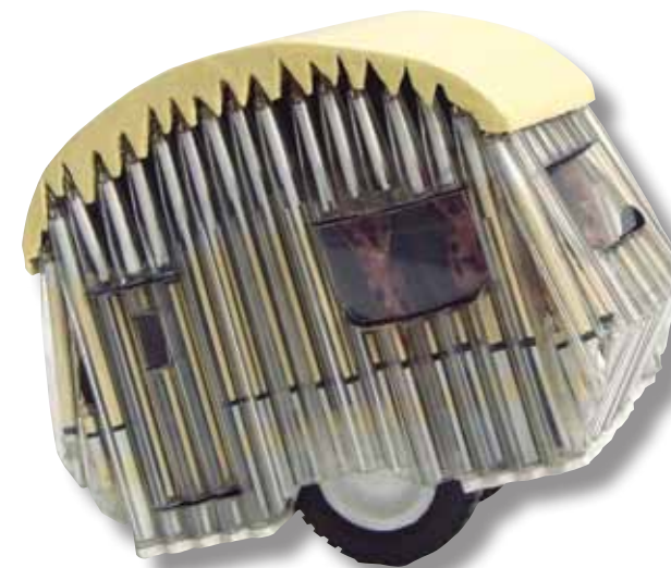
Gemma Coyle, Bonnie Biro Caravan 3 , 2010

Explore the structure of contemporary tapestry weaving. You will create a small tapestry exploring colour, surface and texture, using a wide range of materials, from recycled paper and plastic to traditional cotton, linen and wool. You will be encouraged to create a work in response to the sea/landscape of Scotland. With artist Fiona Hutchison.