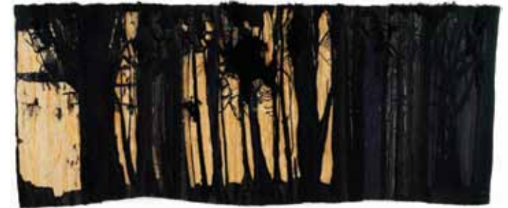
Maureen Hodge (b.1941), Winterwood IV , 1964

Joanne Soroka is the author of the recently published Tapestry Weaving: Design and Technique , which details the theory and practice of tapestry weaving. It includes the definition and history of tapestry, with the work of many of the participants in That was Then: This is NOW highlighted in the contemporary section. In conjunction with gallery shop.