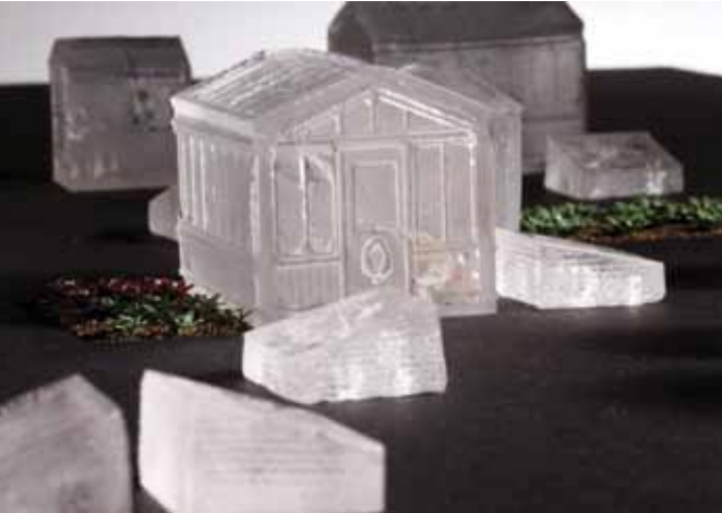
Rachel Elliott, Fringe (detail), 2010. Photography by Simon Bruntell